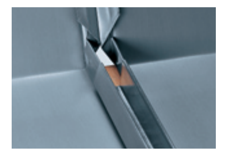
Prepared ridge termination with RHEIN-ZINK-Click Roll Cap fastener