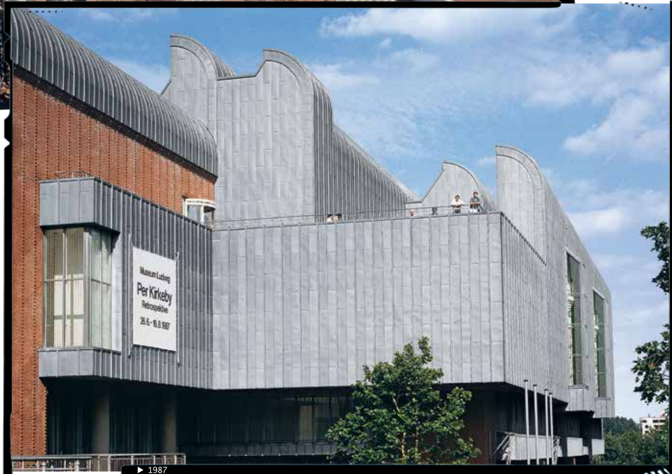
Museum Ludwig, Cologne - 1987