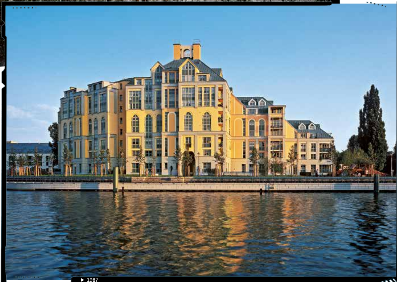
Tegeler Hafen, Berlin – 1987