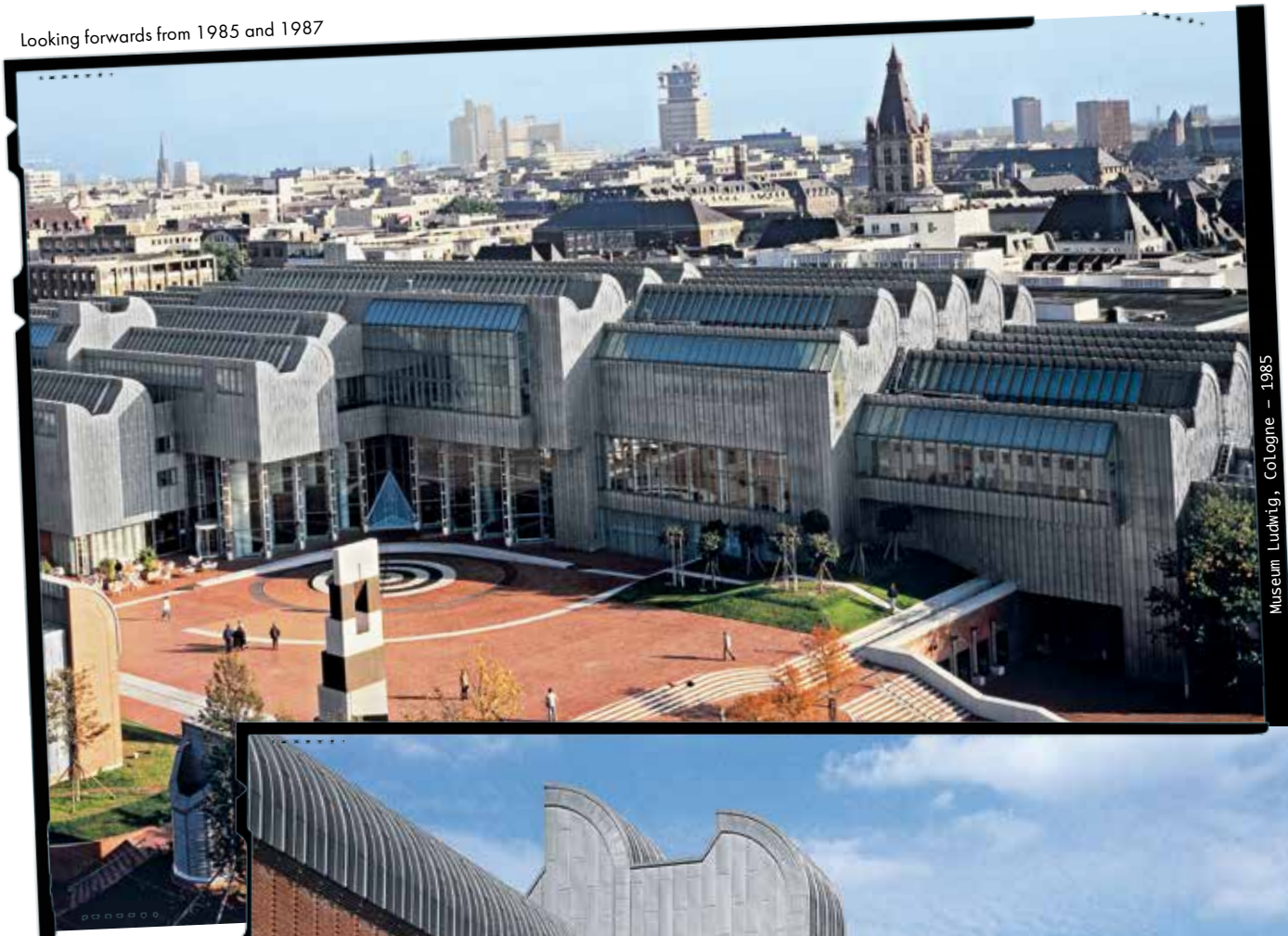
Museum Ludwig, Cologne - 1985