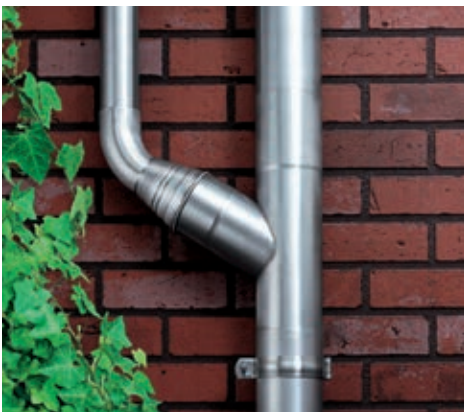
RHEINZINK-CLASSIC bright rolled

Comprising over 500 parts, our roof drainage system is the most comprehensive on the market – by far! This means: no compromises – even when it comes to special requests, requirements or shapes. It also means that you can benefit from the competence of a market leader. And ... that you can depend on the proven system of a reliable brand. Our preweathered surfaces are unique worldwide. A uniform, ready-made zinc patina ex works without impairing the natural patination process. This elegant and stylish finish offers lasting protection and can even smooth out scratches over time.